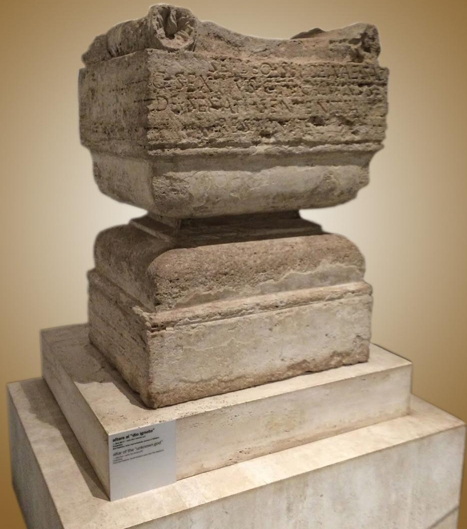
altare al "dio ignoto"