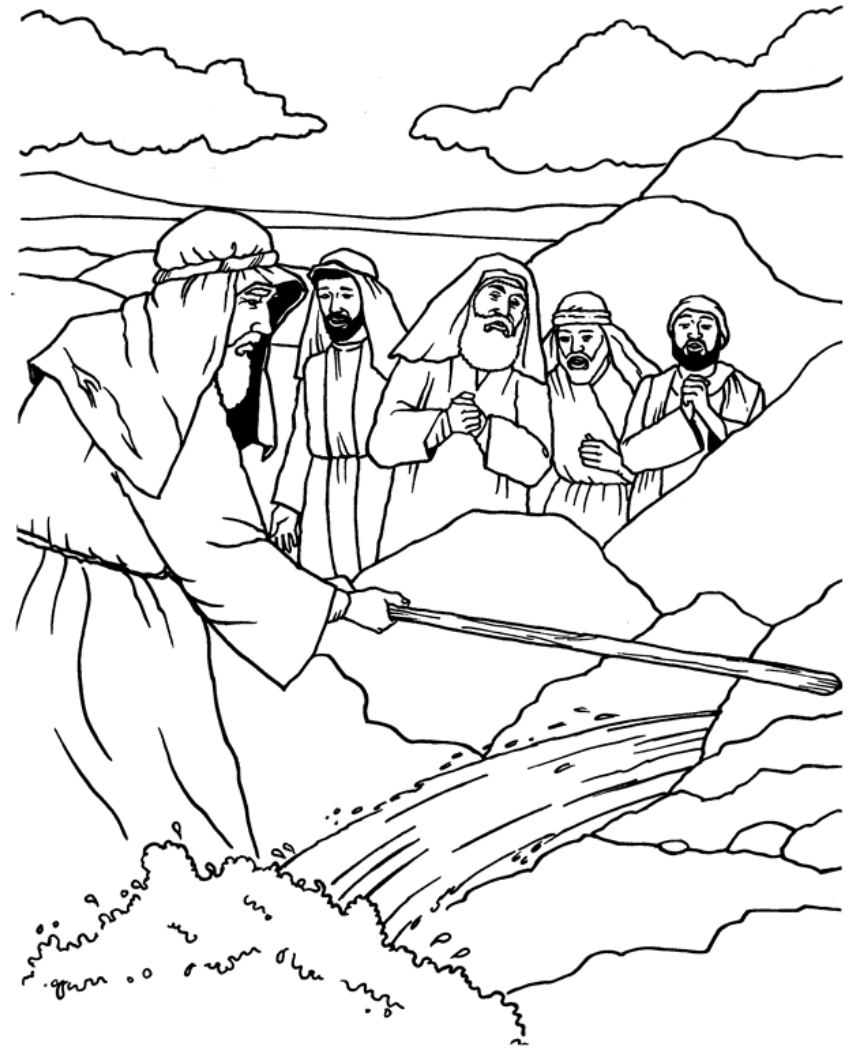
Moses Strikes the Rock Exodus 17:1-7

From BibleStoryCard Learning System(tm) Coloring Book © 1996 Wesleyan Publishing House Used by permission. Additional BibleStoryCard resources available by calling 1-800-493-7539 or visiting online http://www.parable.com/wph/group_1052.htm