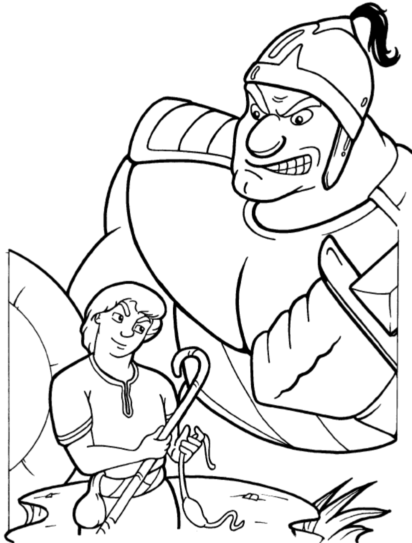
David & Goliath 1 Samuel 17:32-49